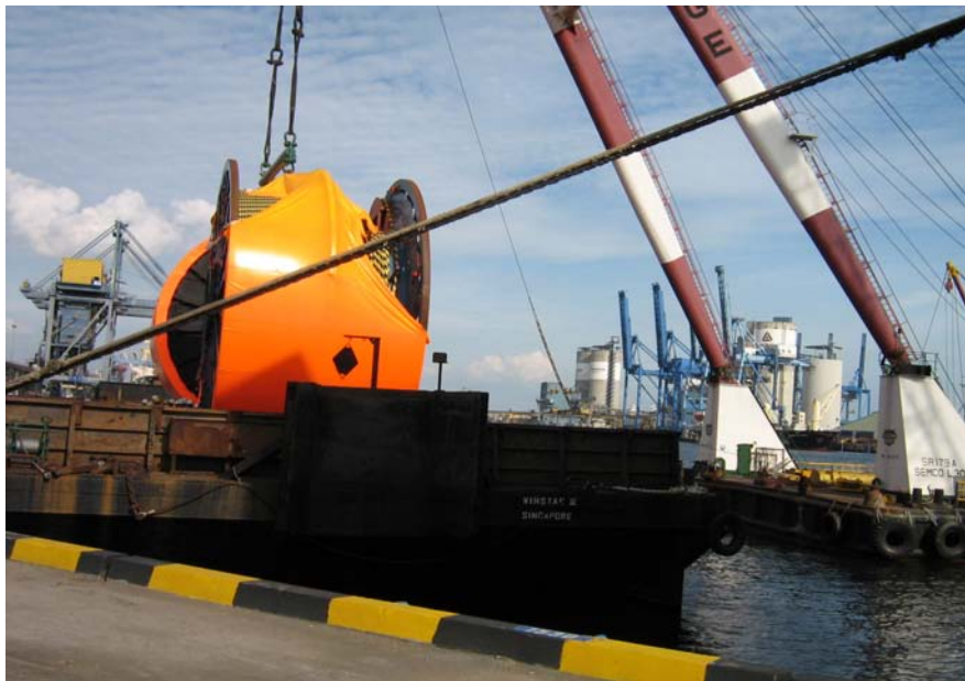
Lifting of Reels Cargo done by utilising Semco floating crane